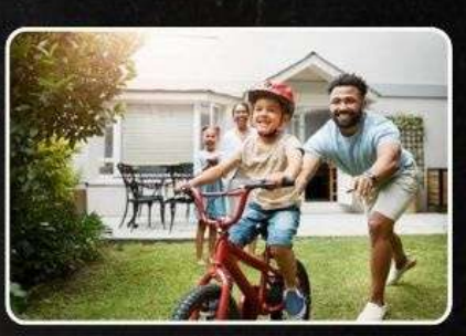
समय की आजादी